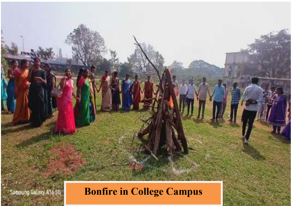
Bonfire in College Campus